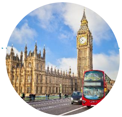
Visit Parliament Square & see Big Ben