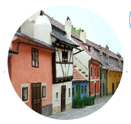
Walk down Golden Lane