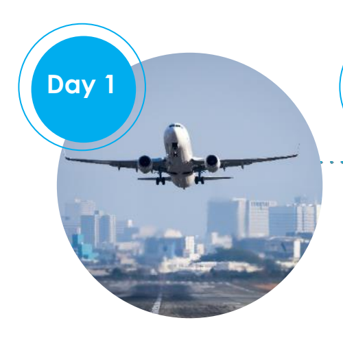
Fly overnight to England