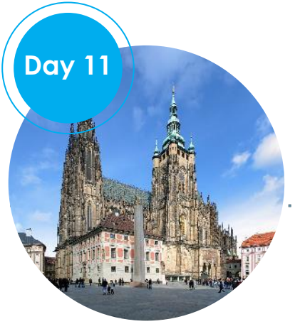
Explore Prague with an expert local guide