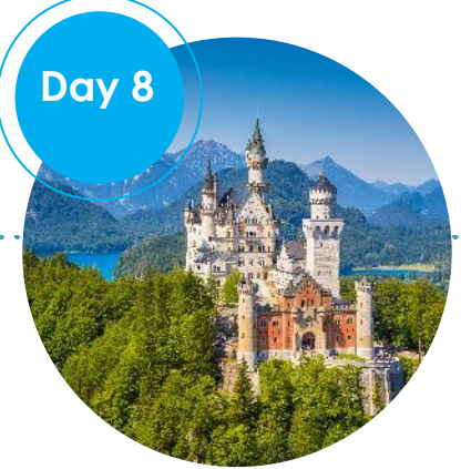
Visit Neuschwanstein Castle on the way to Munich