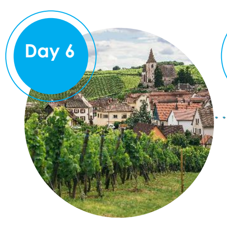
Travel via Burgundy to Lucerne