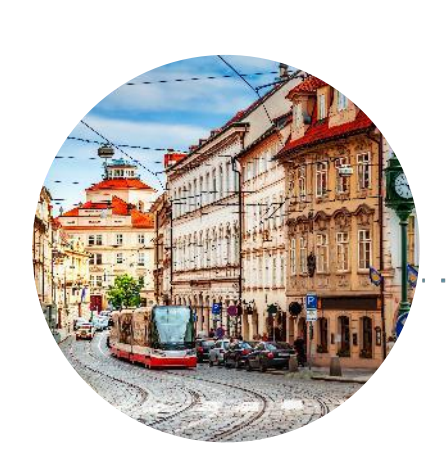
Take a walking tour of Prague