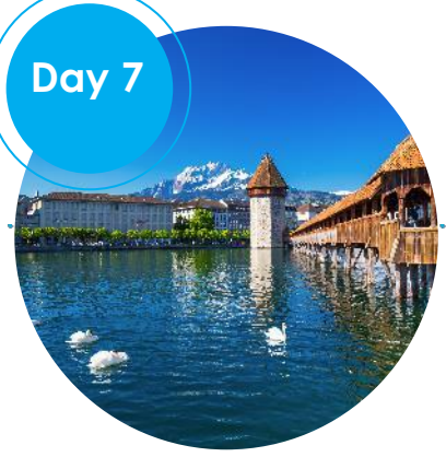
Take a walking tour of Lucerne