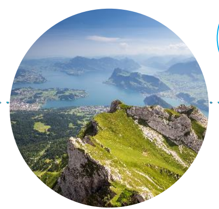
Participate in the Swiss Alps Experience